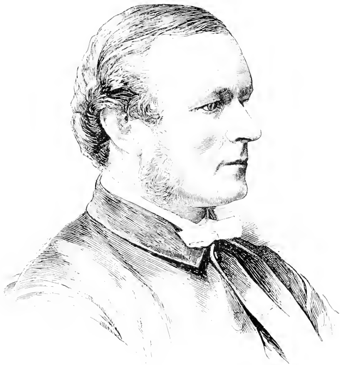
FREDERIC WILLIAM FARRAR.